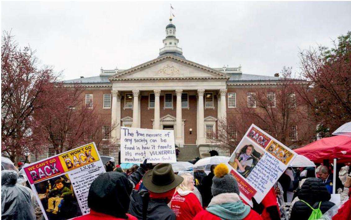
Photo: Crowds of advocates, activists, families and individuals with disabilities rallied earlier this month outside the State House in Annapolis, Md. to protest cuts to the Maryland Developmental Disabilities Administration.

Across the country, disability advocates are warning that services supporting people with disabilities are facing unprecedented risks. Even before recent developments, many programs were already strained by workforce shortages, long waiting lists, and rising costs. Now, proposed federal and state policy changes could significantly deepen these challenges.