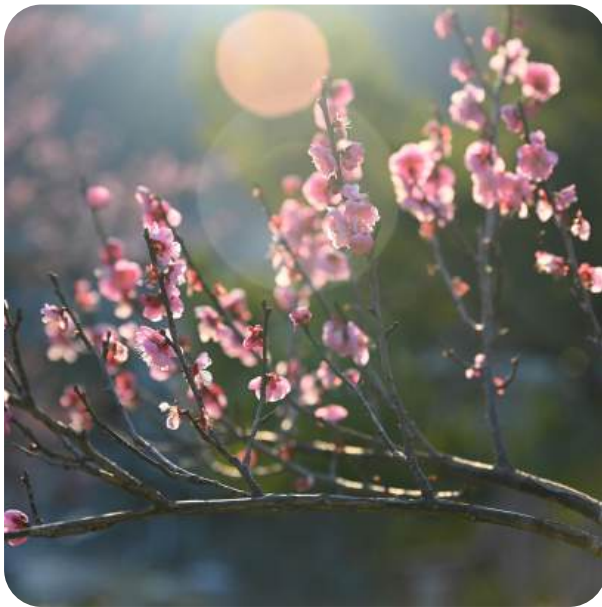
Photo: Close-up of pink cherry blossoms on branches with a soft bokeh background and lens flare.